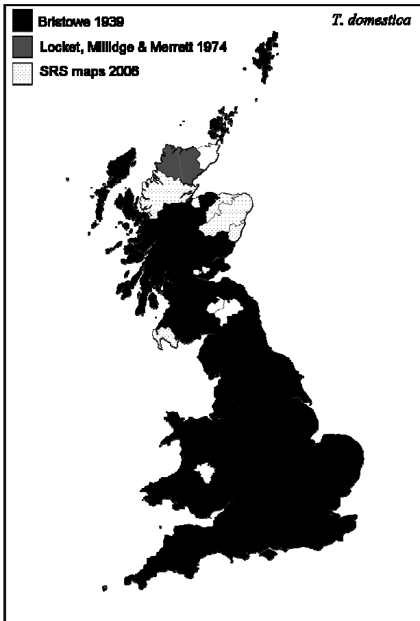
Fig. 1: Pre-1974 county map showing the distributions of Tegenaria domestica at three time periods (see text for more details).

(1858: 94) mentioned T. domestica as “our common domestic spider” in Berwickshire, Pickard-Cambridge (1895) recorded it at several sites in Cumberland, Hull (1896: 69) described this species as “the common house spider, to be seen in the unswept angles of buildings everywhere” in Northumberland and Durham, and Jackson (1906: 357) regarded T. domestica as “one of the two common house spiders” (the other was Amaurobius similis (Blackwall)) in the Tyne Valley, Northumberland. Likewise, Harrison (1909: 227) wrote “the common house spider of the district” in his report on the spiders of Middlesbrough, and Pickard-Cambridge (1907) recorded T. domestica from across Yorkshire, as did Falconer (1922).