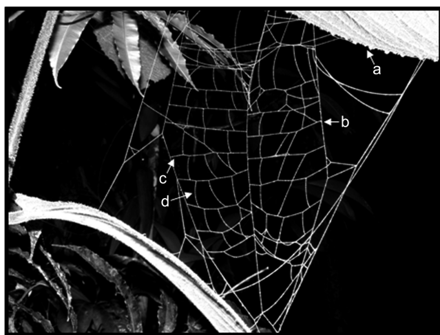
Fig. 1: Web (height 19 cm, width 13.5 cm) of an adult female of Synotaxus sp. powdered with cornstarch: a =leaf retreat; b =vertical frame thread; c =horizontal frame thread; d =sticky thread.

All webs ( n=53 , including webs not forming part of the censuses) were constructed in the understory of mature and old growth forests, between 20–70 cm above the ground. The height of webs ranged from 16–37 cm and the width from 13–27 cm. The web contained vertical non-sticky lines that extended from a relatively long, horizontal leaf that served as the spider's retreat, downward to other leaves below (Fig. 1: a–b). Horizontal dry threads connecting the vertical lines completed the network of non-sticky lines to which the spider attached the sticky threads (Fig. 1: c–d). There was a relatively dense tangle of thick, dry threads near the lower surface of the retreat leaf. This tangle was attached along part of the border of the leaf, forming a structure similar to an upside-down canoe. When resting, these green, slender spiders hung upside-down along the central vein of the leaf, and were very difficult to see. The webs constructed by juveniles ( n=2 ) were apparently similar to the adult