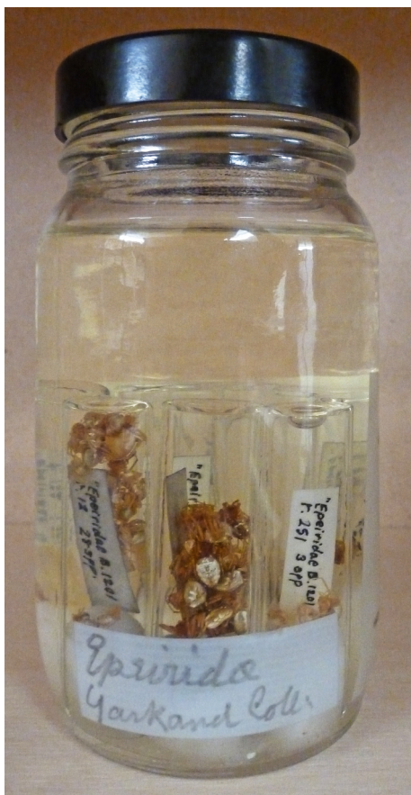
Fig. 1: A bottle from the OPC Exotic Araneae collection showing the minimal labelling present. The handwritten label in pencil is the original, the labels in vials written in ink have been added at a much later date.

are brief, and do not contain data about number of specimens being studied at the time of writing.