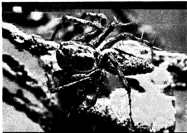
Figs. 1 - 2. Female Oxyopes heterophthalmus Latr. guarding egg cocoon on Calluna .

The specimens were brought back to the British Museum (Natural History) where one was photographed by Mr.K.H.Hyatt of the Arachnida Section (Figs. 1 & 2).