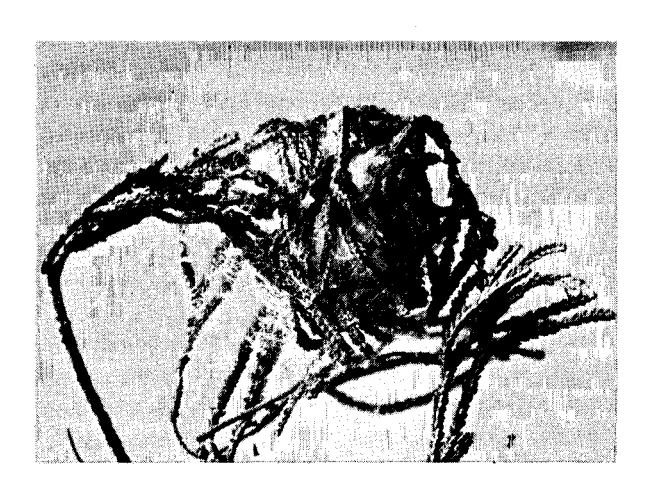
Fig. 3: Nest cocoon of Cheiracanthium pennyi on Calluna

identified as C.pennyi by D.J.C., whose drawings of the male palp of this specimen and of C.erraticum (Walck.) are figured here (Figs. 1 & 2).