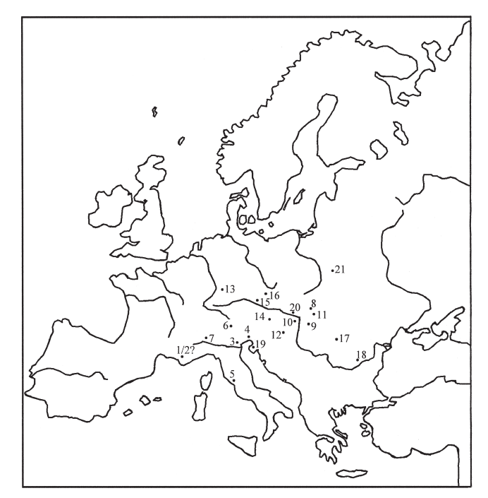
Fig. 1: Known distribution of Mysmenella jobi in Europe. Locality numbers as in Table 1.

(c) 1\delta , 17-30 June 1998 (Fig. 2), collected by pitfall traps, leg I. Hajdamowicz; Ledo-Sphagnetum magellanici — a plot with a very open stand of pine and birch, moderately sunny. Oxycoccus quadripetalus, Andromeda polifolia, Ledum palustre and Vaccinium uliginosum were dominant in the shrub layer and Menyanthes trifoliata in the herb layer.